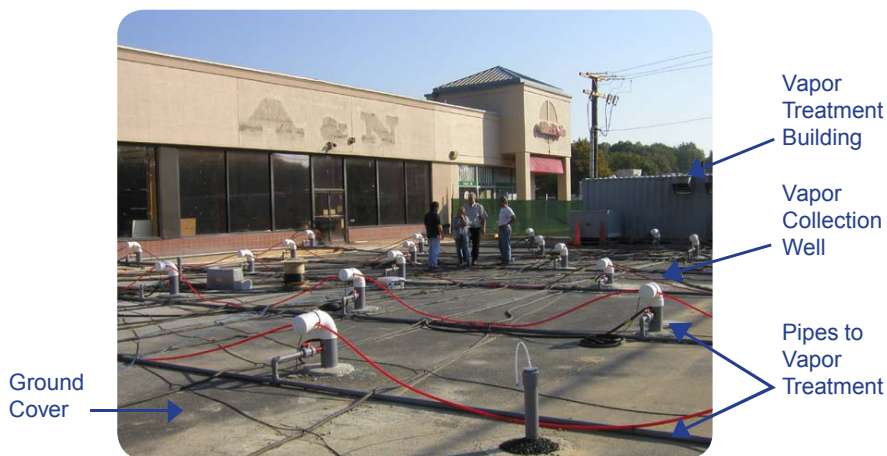
ERH system cleans up contaminated soil and groundwater.

In situ thermal treatment methods speed the cleanup of many types of chemicals, and are among the few in situ methods that can clean up NAPLs. Thermal treatment can be used in silty or clayey soil where other cleanup methods do not perform well. They also can reach contamination deep underground or beneath buildings, which would otherwise be difficult or costly to dig up to treat above ground. In situ thermal treatment has been selected or is being used in cleanups of at least 12 Superfund sites as well as dozens of other sites across the country.