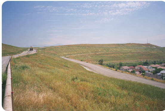
Spring grasses grow on the cap of a hazardous waste landfill.

Capping is the traditional method for isolating landfill wastes and contaminants. It sometimes is used to address large volumes of soil or waste with low-levels of contamination. Caps made of asphalt or concrete, or even a layer of soil planted with grass, can allow some sites to be reused. Caps have been selected for use at many Superfund sites across the country.